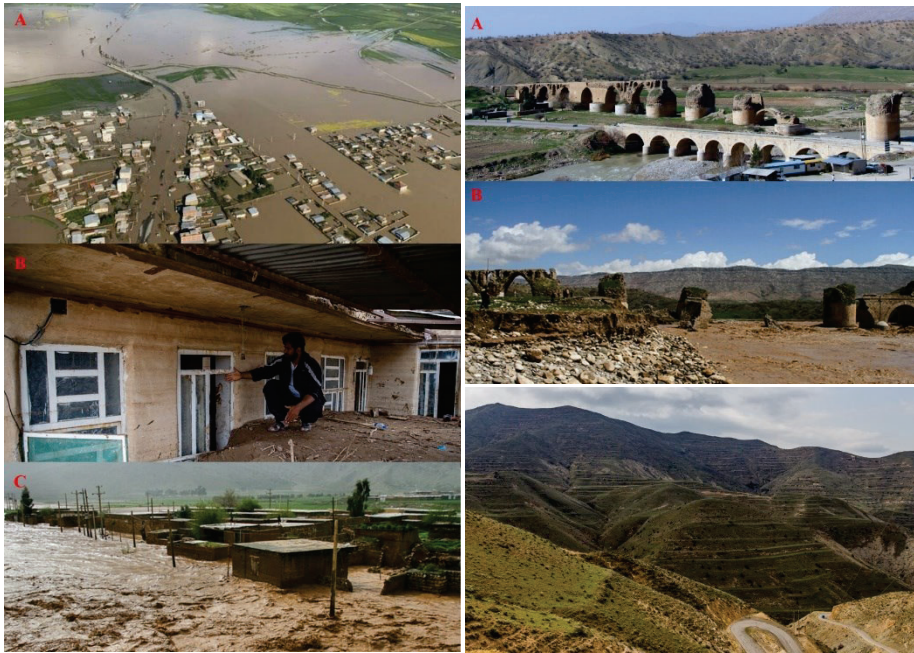
Figure 3. The recent floods in Iran and their damages (March, 2019); A. The city of Agh Ghala, Golestan Province; B. The remained mud after the flood in houses, Pol Dokhtar, Lorestan Province; C. Flood-water running in the vicinity of the Pol Dokhtar city. (Photos by Mehr, Fars and ISNA news agencies, respectively). Figure 6. The Kashkan Bridges; A. Before the flood; B. After the flood. Note that the historic bridge that shows minor changes compared to the new one (Photos by Pars Geological Research Center and ISNA news agency, respectively). Figure 7. The remnants showing the method of plowing in old times perpendicular to the topographical dip, Astamal, East Azerbaijan Province, Iran (Photo by the Pars Geological Research Center).

of large rivers. This can lead to dryness and disappearance of vegetation cover. On the other hand, it can result in typhoon and swarm of fine particles in the eastern region of Iran. In our country, the problem is much more severe as the observed trend has started since a for a few decades, many internal lakes have dried such as Hamoon lake in Sistan and Baluchistan, Qom Lake, ..., and where is the water-abundant Urmia Lake), and this trend is going on.